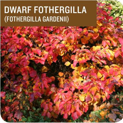
DWARF FOTHERGILLA (FOTHERGILLA GARDENII)