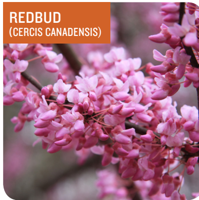
REDBUD (CERCIS CANADENSIS)