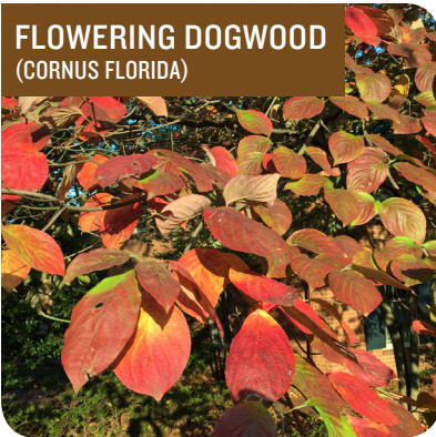
FLOWERING DOGWOOD (CORNUS FLORIDA)