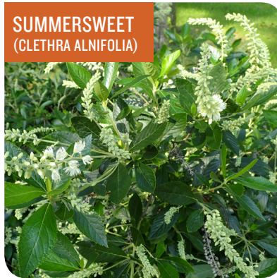
SUMMERSWEET (CLETHRA ALNIFOLIA)