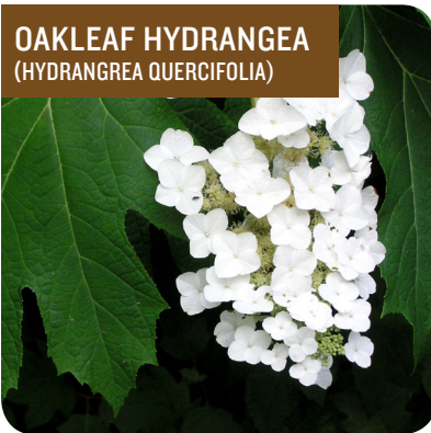
OAKLEAF HYDRANGEA (HYDRANGAEA QUERCIFOLIA)