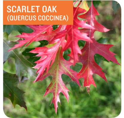
SCARLET OAK (QUERCUS COCCINEA)