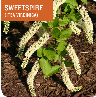
SWEETSPIRE (ITEA VIRGINICA)