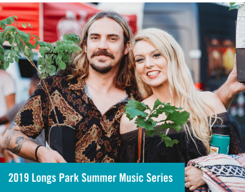
2019 Longs Park Summer Music Series