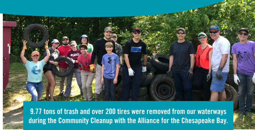
9.77 tons of trash and over 200 tires were removed from our waterways during the Community Cleanup with the Alliance for the Chesapeake Bay.