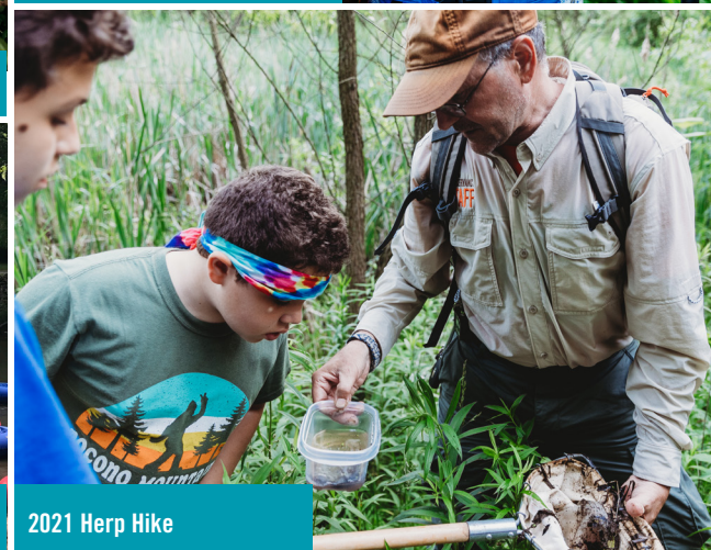
2021 Herp Hike