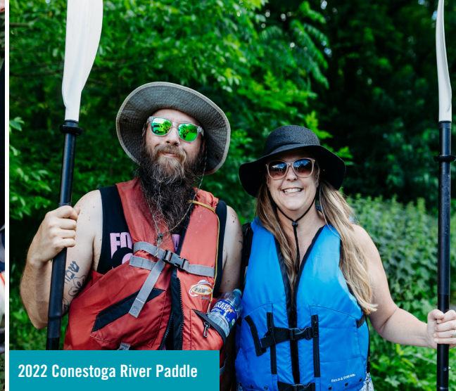
2022 Conestoga River Paddle