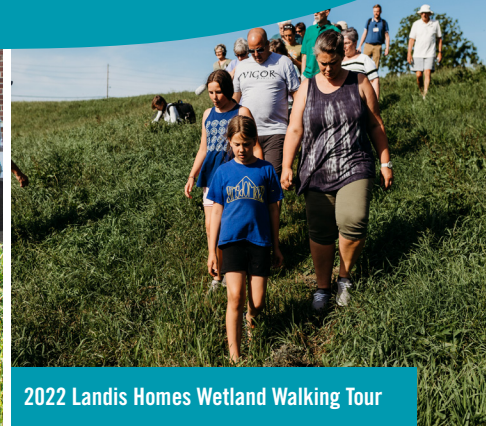
2022 Landis Homes Wetland Walking Tour