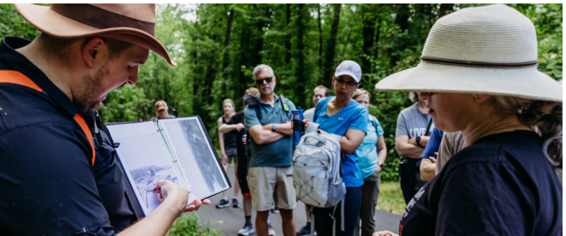
Intrepid hikers learned about the history hidden within our wetlands along the banks of the Susquehanna River.