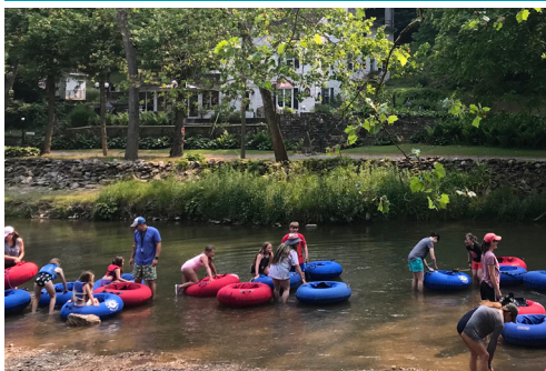
2023 River Clean Up at Sickman's Mill