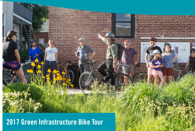
2017 Green Infrastructure Bike Tour