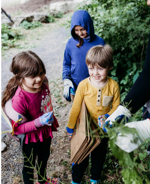
2022 Conestoga Clean Up