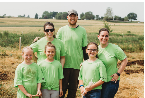
2019 Streamside Care Day