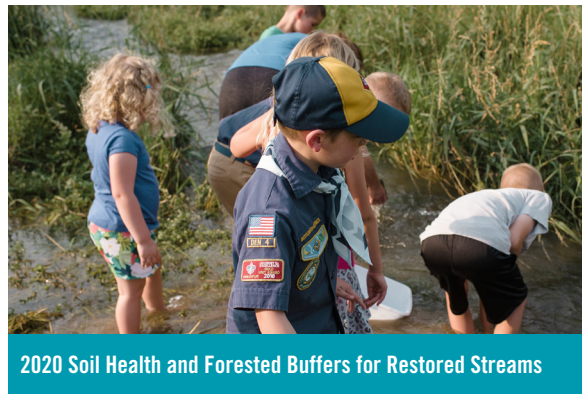
2020 Soil Health and Forested Buffers for Restored Streams