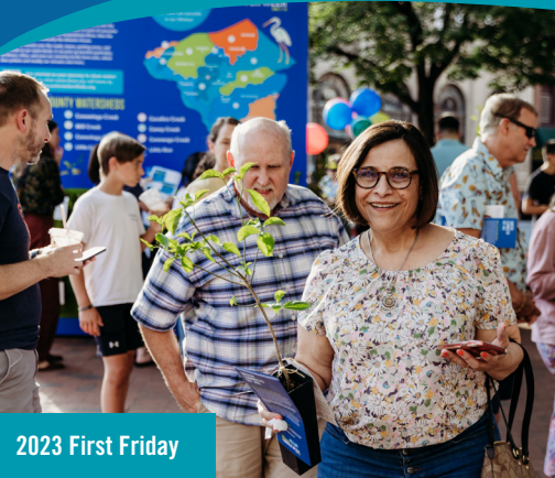
2023 First Friday