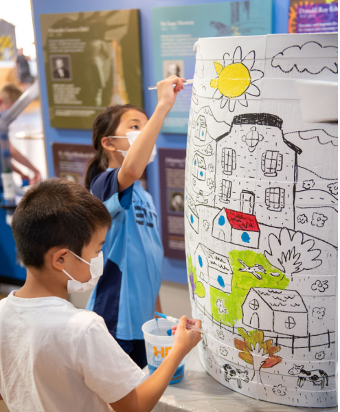
2021 First Friday at the Lancaster Science Factory