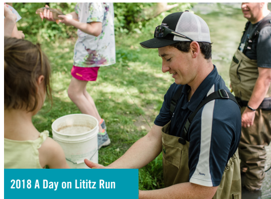
2018 A Day on Lititz Run