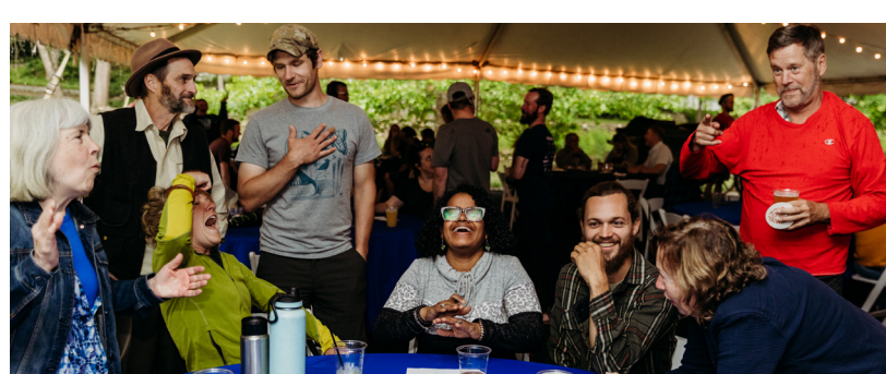
Water Week Trivia Night at Sickman's Mill brought competition and celebration to the banks of the Pequea River.